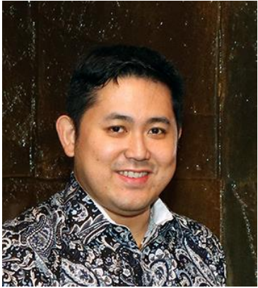
His Royal Highness Prince Abdul Qawi of Brunei Darussalam

HugProperty is grateful to the following business leaders who have granted their valuable time and expert advice to the HugProperty team: